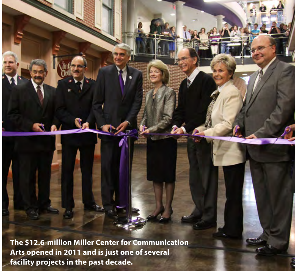
The $12.6-million Miller Center for Communication Arts opened in 2011 and is just one of several facility projects in the past decade.