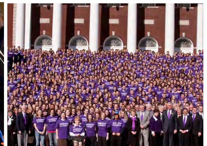
Asbury College becomes Asbury University in 2010.