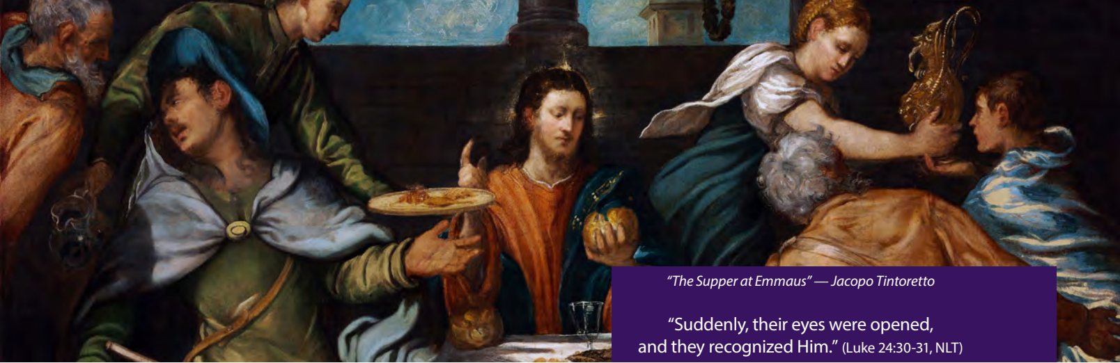
"The Supper at Emmaus" — Jacopo Tintoretto

"Suddenly, their eyes were opened, and they recognized Him." (Luke 24:30-31, NLT)