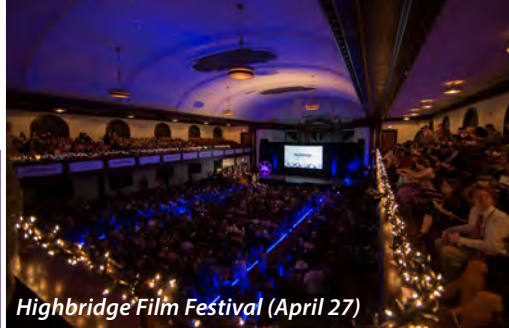
Highbridge Film Festival (April 27)