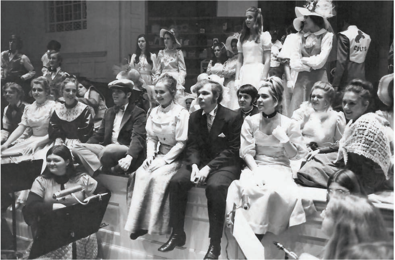
(A presentation of Hello Dolly by the Patriot Class of 1974.)