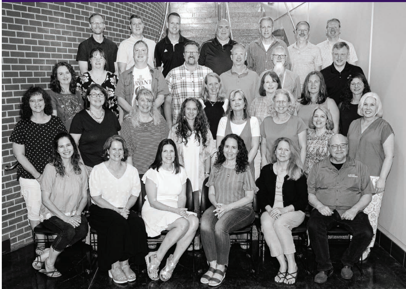
1993 Servant Class Photo from Reunion 2023.